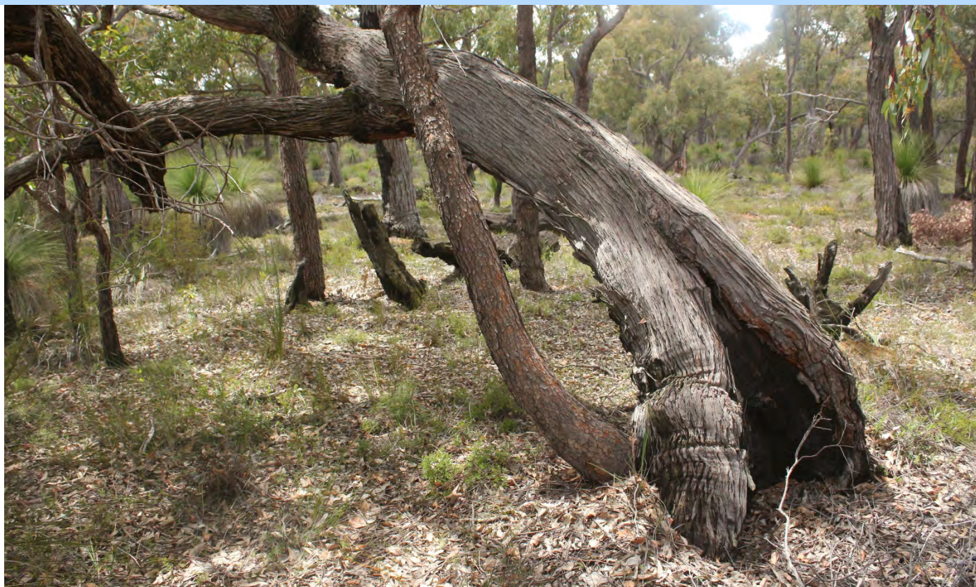
Above: An old jarrah tree - still providing life.